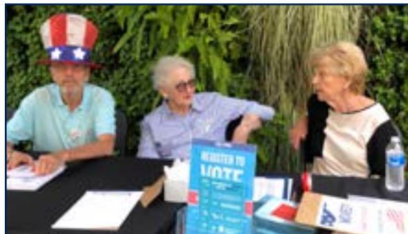
ChaiVillageLA Volunteers help register voters