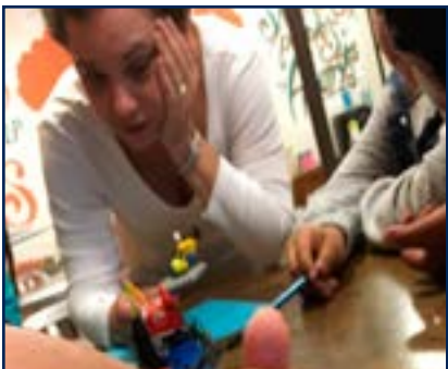
ChaiVillageLA Volunteers at 826LA