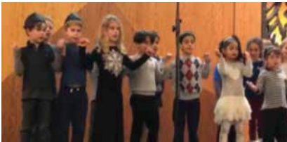
KINDERGARTNERS LEAD OUR SHABBAT SERVICE

Religious School Shabbat: This year, the Temple offered a Shabbat experience designed for Religious School families. Each Shabbat featured a different grade that led a key prayer in our service. The students worked all year long on developing their Hebrew chanting. Our service was enhanced by the presence of a full musical band and our Permanent Players (children's choir). The Shabbat service was well attended by Religious School families and members of our greater community.