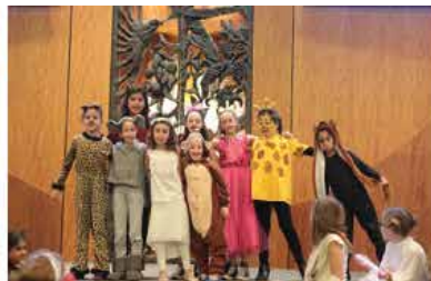
Pop Up Choir Sings Can You Feel the Love Tonight