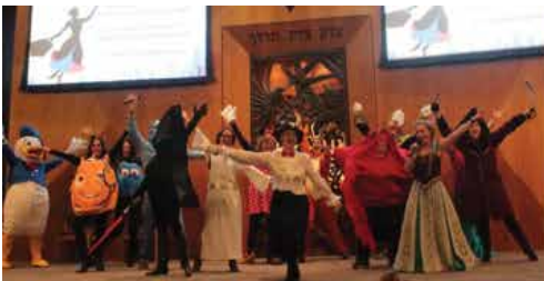
Temple Isaiah Senior Staff Performs the Opening Number

Purim: Our teens starred in this year's packed performance of When You Wish Upon Esther . Our congregation was in awe of our talented teens and our Disney Purim Shpeil. Our Pop Up Choir helped bring the Disney flavor with musical numbers from Star Wars and Lion King.