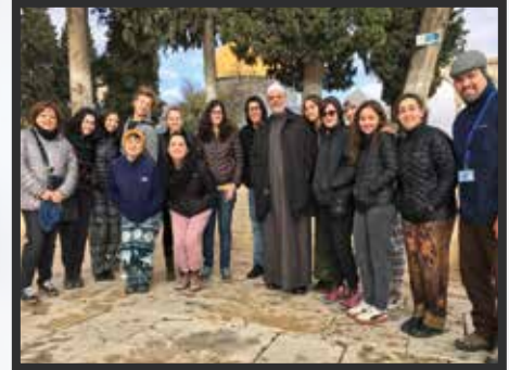
Visiting the Temple Mount in Jerusalem with one of the Imams of the Dome of the Rock mosque.