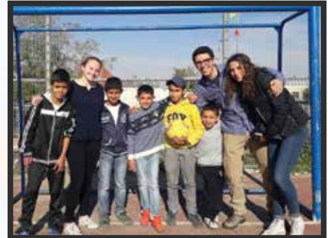
Hanging out after a friendly game of soccer with children from Lakiya in the Negev.