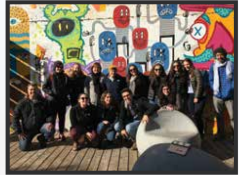
A graffiti tour in Tel-Aviv’s Florentine Neighborhood.

As we returned from Israel, our students expressed gratitude for the opportunity to learn about Israelis and Palestinians “on the ground” in Israel. Now, they have a much deeper understanding of the security concerns that must be considered when negotiating for peace and for day-to-day travel across the borders. They also understand the human rights concerns that must remain in focus. Kol HaKavod to these intrepid travelers who spent 10 days renewing their relationship with Israel, with one another, and with our community.