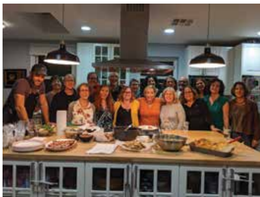
Flavors of Israel Class