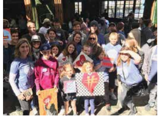
Family Philanthropy Club volunteered with Hashtag Lunchbag