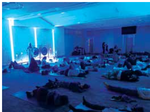
Shabbchella - Soundbath