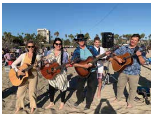
Guitar Squad at Tashlich at the Beach