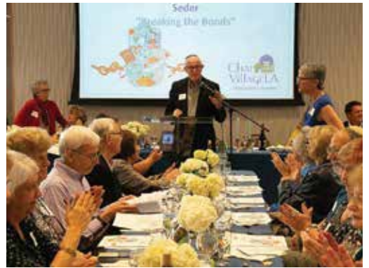
ChaiVillageLA Passover Seder