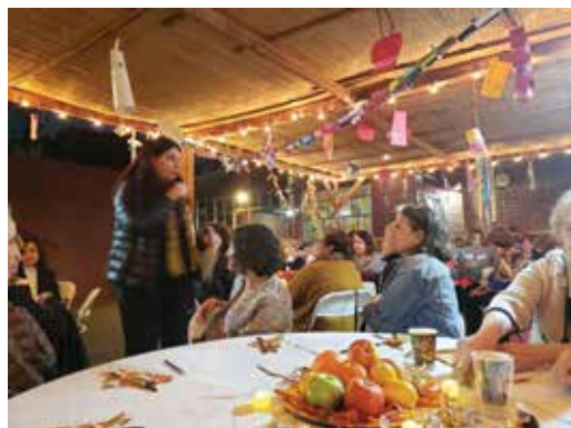
Isaiah Women Sukkot Celebration