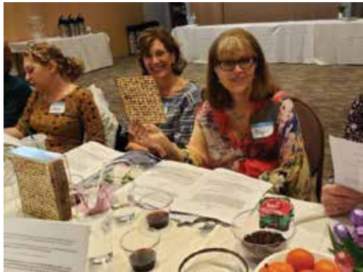
Isaiah Women Passover Seder