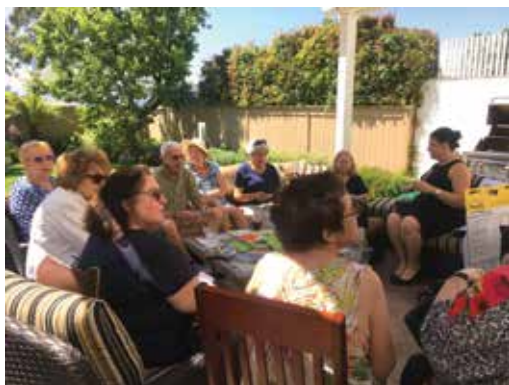
ChaiVillageLA: Conversations with Clergy