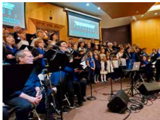
Hanukkah Concert Love and Light