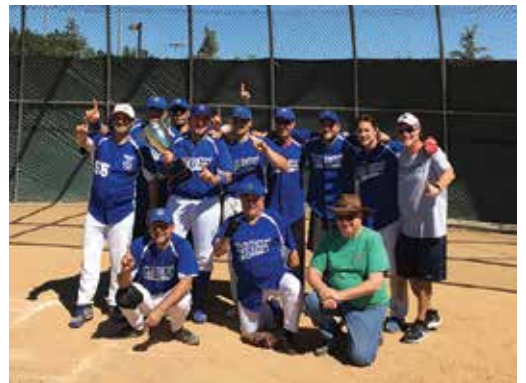
Hammerin' Hebrews softball team win 3rd division title