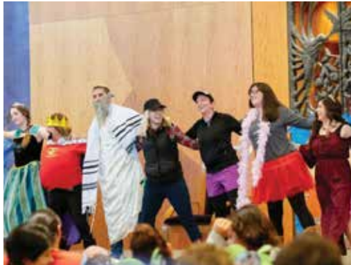
Purim Preschool Shabbat