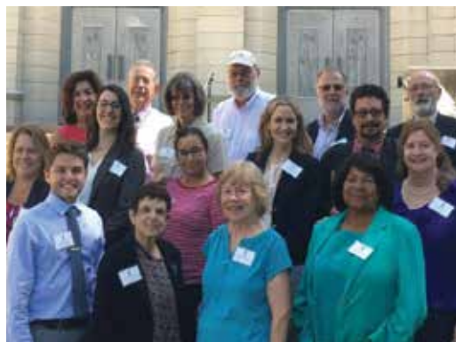
Lobby Day In Sacramento