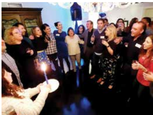
RSPA Hanukkah Party