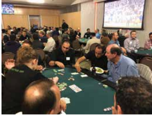
IMG Poker Night