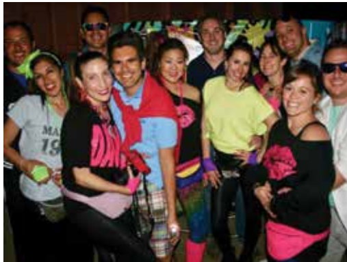
80s' Night at THE WKND- Family Camp